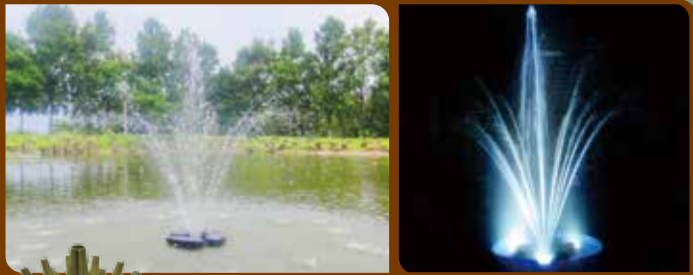
Type C: 3-layer flower