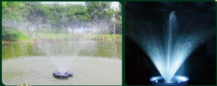
Type A: Fireworks