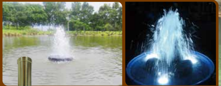
Type D: Gushing