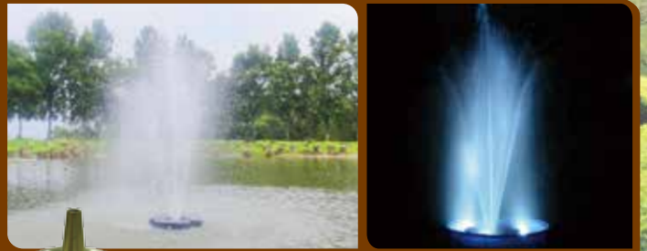
Type B: Multi-jet style